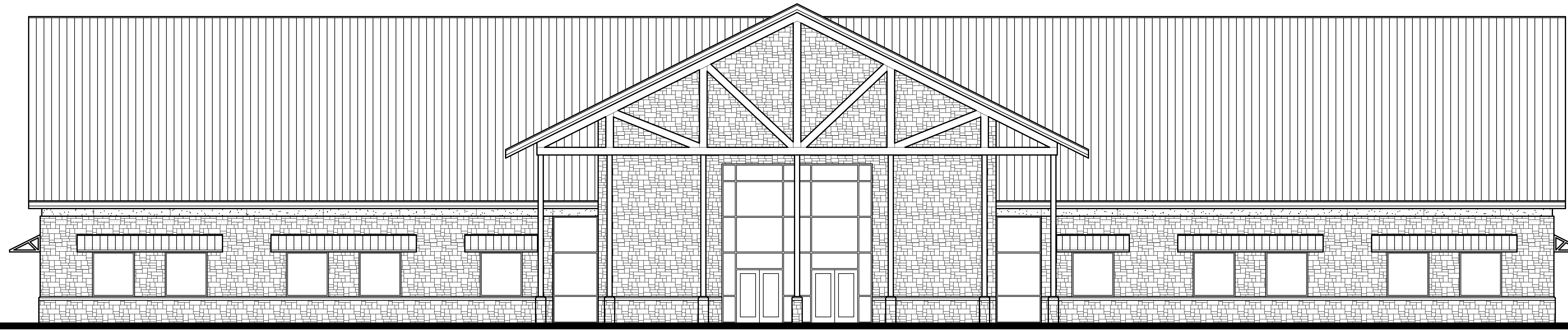
PROPOSED WEST ELEVATION - CITY HALL